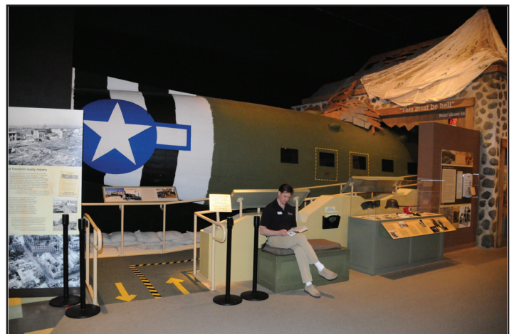
A D-Day display at the Minnesota Historical Society features a C-47 fuselage and other WW II artifacts.

visit to their facility. The MHS Staff was very accommodating and a pleasure to work with. The AGM is looking forward to a bright and productive relationship with the MHS in the future.