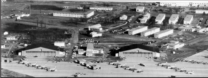
Base flightline and hangars in 1957.

The building that houses the Minnesota Air National Guard Museum, building 670, was erected in 1953 as an Air Defense Command "Alert Hanger". It was initially used by an active Air Force unit, the 18th Fighter Interceptor Squadron, in 1953. The 18th FIS first used the F-51 (P-51), then F-86F and in less than a year after activation, the F-89 Scorpion in January 1954.