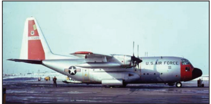
Museum's C-130 when on active status.

Interesting Facts: The C-130 holds the record for the largest and heaviest aircraft to land on an aircraft carrier, it made 29 touch-and-go landings, 21 unarrested full stop landings and 21 unassisted take-offs on the USS Forrestal in October and November 1963. The museum C-130 is a C-130A re-designated as a C-130D after being equipped with skis. The C-130 is the largest aircraft to ever land and takeoff with skis, a mission that the C-130 still flies. In the 1950s the USAF had a C-130 aerial demonstration team called the "Four Horsemen" utilizing four C-130A aircraft. The last C-130 flight out of South Vietnam before that country's collapse to North Vietnam was made on April 29, 1975 when a Republic of Vietnam Air Force C-130A, heavily overloaded estimated at 20,200 pounds over gross, lifted off from Tan Son Nhut Air Base with 452 people on board, 32 of them crowded into the Hercules flight deck.