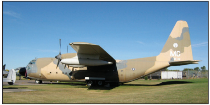
Minnesota ANG museum's C-130D

ARMAMENT: NONE (FOR THE TRANSPORT VERSION)