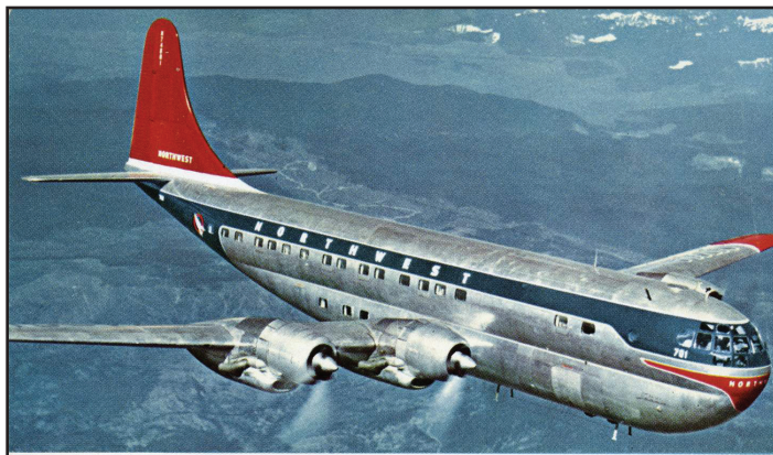
Northwest Airlines Stratocruisers — Finest . . . Largest

The museum’s C-97 enjoys a spot between hangars of the Minnesota Air National Guard base in St. Paul, Minn. on Oct. 17, 2018.