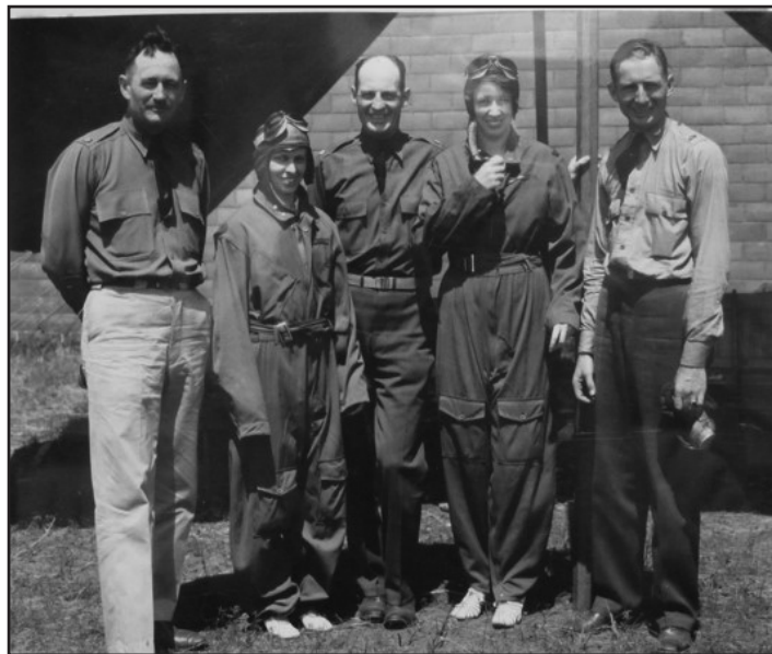
Two nurses assigned to duty Camp Ripley (first ones) 1933-34.