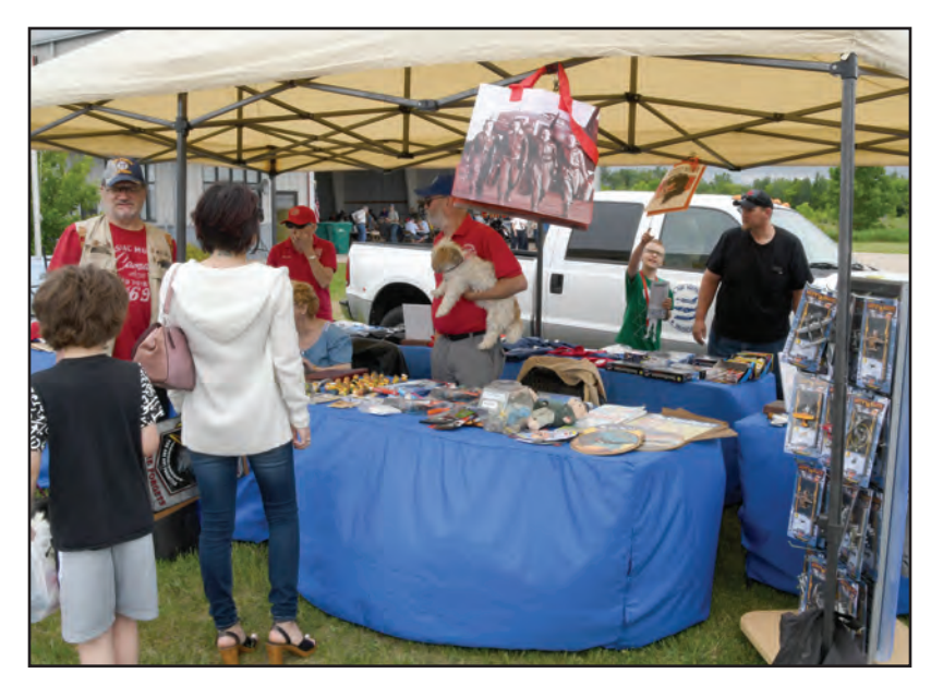
Events story from on page 1

Even with fewer off-base events and cancellations due to bad weather, the events were profitable for the museum. We were able to utilize the museum's new used truck that we purchased earlier this year. The truck was reliable and efficient when pulling the F-4 Photo Phantom, and we were able to pack all of our gift shop items in the covered truck bed with room to spare.