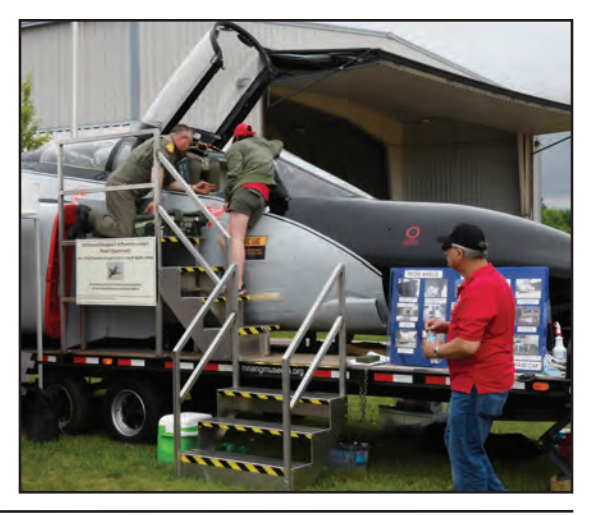
What cockpits are these? F-4, F-16, F-51, F-89, F-94, F-101, or F-102? (Answers on page 7.) submitted by Kirk Ransom #2 #3